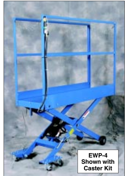
EWP-4 Shown with Caster Kit