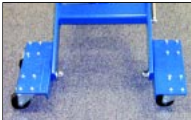
203-0903: Caster Kit