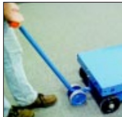
203-0905: T-Bar Transport Kit

View our website - www.lpi-inc.com for more information on the Elevating Work Table or any of our other products. Our engineers will work closely with you to develop a system designed specifically to your application.